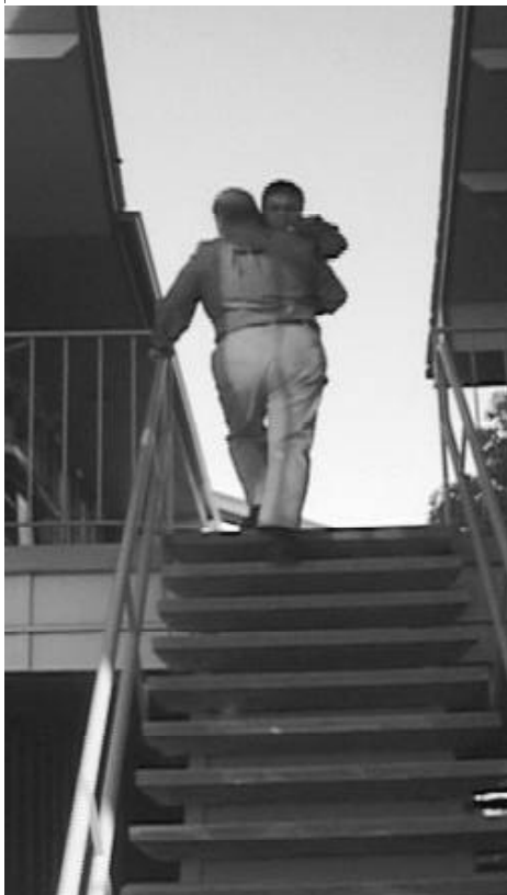
The old way of getting Sunny up the stairs